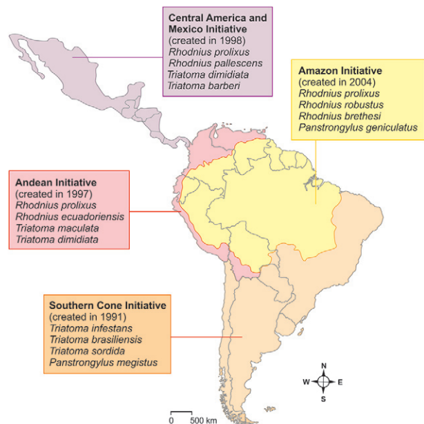
Fig. 2: continental initiatives for controlling the main vectors of Chagas disease [adapted from Guhl (2007)]