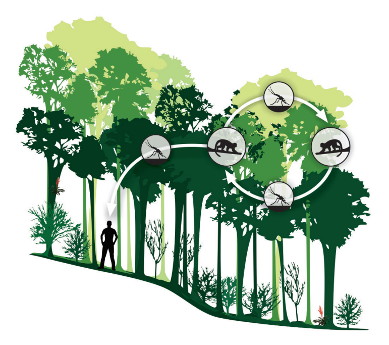
Fig. 5: in some conditions, Anopheles (Kerteszia) cruzii may bite both at the canopy of the trees and close to the ground, which may favour the transmission of simian plasmodia to human in the wild or in the close vicinity of the forest.

by molecular tests. Therefore, P. knowlesi is currently considered by many to be a fifth Plasmodium species that naturally infects humans (Cox-Singh et al. 2008). Some authors, however, will not consider P. knowlesi as a human parasite until natural human-to-human transmission is demonstrated. Following these first cases, imported human cases due to P. knowlesi have been reported in many other Asian countries (Jongwutiwes et al. 2004, Luchavez et al. 2008, Ng et al. 2008, Van den Eede et al. 2009, Cox-Singh 2009, Jiang et al. 2010, Khim et al. 2011, Tanizaki et al. 2013) as well as in Europe, Oceania and North America [for review, see Müller and Schlagenhauf (2014)]. To our knowledge, there is no record of P. knowlesi cases in Africa or Central and South America.