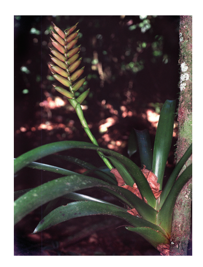
Fig. 4: the malaria vector Anopheles (Kerteszia) cruzii breeds in water accumulated in the axils of shaded and epiphyte bromeliads, such as Vriesea sp.

discovery of a single malaria case usually involve simply recording the composition of anopheline fauna and highlighting the most abundant species; these surveys seldom note the most frequent species biting indoors and local entomological teams cannot search for natural plasmodia infections in mosquitoes. Therefore, the determination of malaria vectors outside the Amazon has mostly been based on behavioural and biological data gathered during and just after the appearance of a newly introduced case or outbreak.