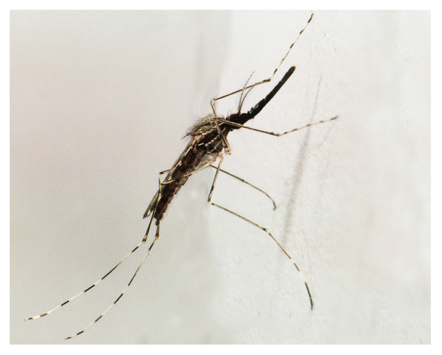
Fig. 3: Anopheles (Kerteszia) cruzii , the mosquito vector of both the human and simian malarias in the Atlantic Forest of southern and southeast Brazil.