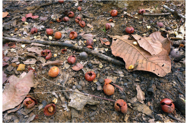
Fig. 3: sugar plum ( Uapaka kirkiana ; Phyllanthaceae) with bat tooth marks on fruits husks, Zambia.

Although bats have been distinct from other mammals for more than 52 million years, bats, carnivores perissodactyls and artiodactyls share part of their evolutionary history that is not shared with other mammals and their ancestors may have co-evolved with ancient lineages of certain viruses. This suggests that they may share physiological characteristics that could facilitate circulation of these viruses. Dobson (2006) visited pig farm sites where outbreaks of Nipah virus infections occurred in Malaysia and found partially eaten fruits with bat teeth marks in them. According to Dobson (2006), pigs may have been contaminated by eating fruits that had been partly eaten by bats and subsequently passed the virus to humans. This hypothesis was tentatively rejected by Fenton et al. (2006) based on the argument that