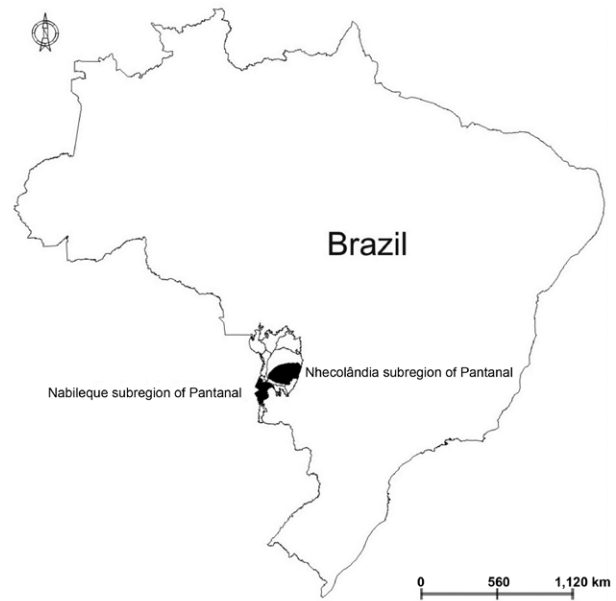
Fig. 1: subregions of Nhecolândia and Nabileque of the Pantanal where an alphavirus serosurvey was conducted in equids, sheep and free-ranging caimans in 2009, 2010 and 2011.

Blood samples from equids (n = 748), including horses (n = 691), donkeys (n = 24), mules (n = 30) and unspecified equids (n = 3) and from sheep (n = 237) were taken by jugular venipuncture. Gender, age, tameness, breed, vaccination status, travel history outside of Pantanal and history of neurologic abnormalities were recorded for each animal sampled. Among the 748 equids sampled, 264 had been vaccinated for equine encephalitis alphaviruses and 484 had no records of immunisation, according to the owners or the worker in charge of the sampled properties. Because of the scarce information about the vaccine available at the time of vaccination in different ranches, it was assumed that these equids were vaccinated with a bivalent vaccine composed of EEEV and WEEV, which is a common vaccine widely used for preventing equine encephalitis in the country. For equids