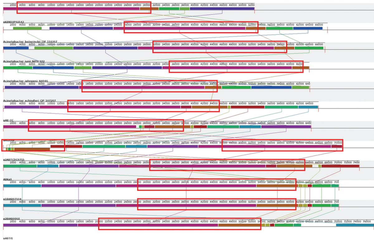
Fig. 1: multiple whole sequence alignments of the plasmids pKBN10P02143, pAB_CC ( Acinetobacter baumannii TYTH-1, KF889012), pACICU2 ( A. baumannii ACICU, NC_010606), p2ABTDC0715 ( A. baumannii TCDC-AB0715, CP002524), ABKp1 ( A. baumannii 1656-2, NC_017163), p1BJAB01704 ( A. baumannii BJAB07104, NC_021727), p2BJAB0868 ( A. baumannii BJAB0868, NC_021731), pABT11 ( A. baumannii MDR-TJ, NC_017848), contigs acLzq-supercont1.5.C13 ( A. beijerinckii CIP 110307, APQL01000013), supercont1.11 ( A. johnsonii SH046, GG704974), acLrq-supercont1.I.C1 ( A. junii NIPH, APPW01000001), and acLsx-supercont1.K6.C31 ( A. schindleri CIP 107287, APPQ01000031) using the Mauve tool. The T4SS regions are indicated in redlined boxes.