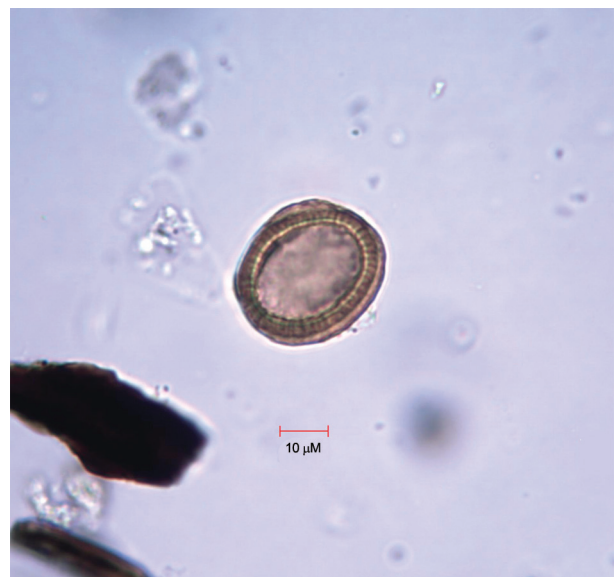
Fig. 3: eggs morphologically similar to Taenia sp. found in the remains from burial #13 at the Nefteprovod II burial ground of Bronze Age East Siberia.

Based upon the available zooarchaeological data, roe deer appear to be the main animals hunted during the Bronze Age. Bones of roe deer, red deer, and elk account for 50% to 95% of all animal bones recovered from Bronze Age archaeological sites in this region (Yermolov 1978, Khamzina 1979). Although the aforementioned animals can serve as intermediate hosts for T. saginata (Shestakov & Novikov 2011), we cannot exclude the possibility that the individual from burial site #13 was infected by another species of Taenia . Since the bones of wild boar constituted less than 1% of the total animal bones recovered from archaeological sites in this region (Yermolov 1978, Khamzina 1979), it seems very