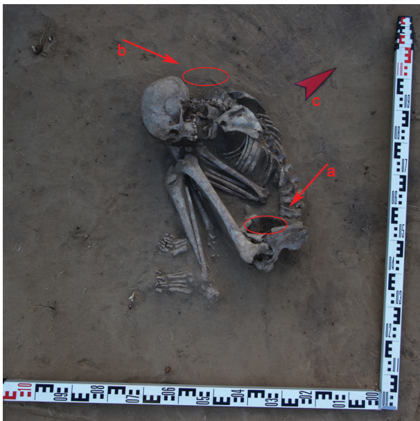
Fig. 2: skeleton from burial #13 at Nefteprovd II was excavated and sampled. (a) The location where the sediment sample was collected for the paleoparasitological analysis; (b) the location where the control soil sample was collected; (c) the arrow indicates the direction of north.

search facility at the Institute of the Problems of Northern Development, Siberian Branch of the Russian Academy of Sciences for further analysis. To control for environmental