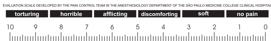
Figure 1 - Evaluation Scale developed by the Pain Control Team in the Anesthesiology department of the São Paulo Medicine College Clinical Hospital (14) - Natal, RN - 2008

In order to evaluate pain intensity the visual analog scale was used, which uses a 10-centimeter line on which the individual points out the pain intensity corresponding to the appropriate area along the line (13) . Since there is no scale for measuring the pain in parturient women, this study chose the visual analog scale developed by the Pain Control Team in the Anesthesiology department of the São Paulo Medicine College Clinical Hospital (14) , as shown in Figure 1.