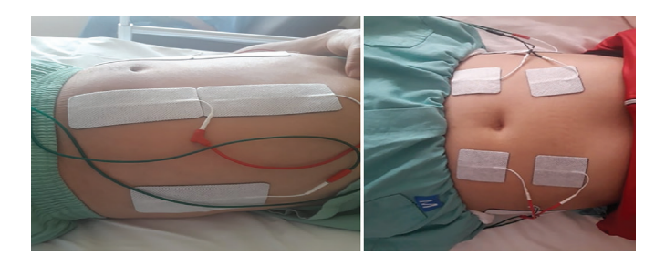
Figure 2 – Positioning of transcutaneous electrodes on transverse and abdominal oblique muscles.

For a better understanding, see the illustrative figure of the positioning of the electrodes on the abdominal muscles during the application of EE by FES current (Figure 2).