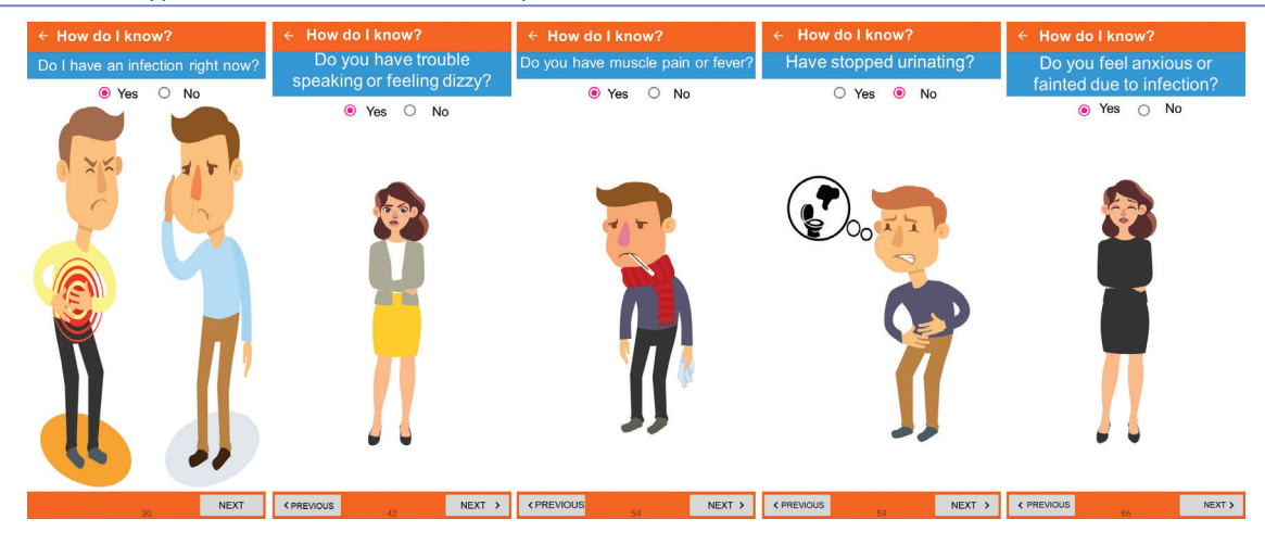
Figure 2 - Screenshots "How to know if I have sepsis?" of the app Sepsis Quick Guide. Pesqueira, PE, Brazil, 2021.