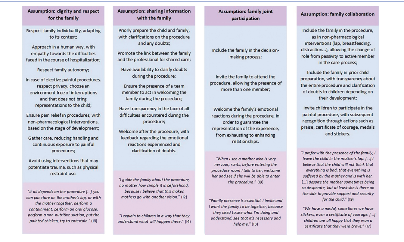
Figure 1 – Strategies used by nursing team professionals to include the family in painful procedures based on the Family-Centered Care assumptions. São Paulo, SP, Brazil, 2021.

process, encouraging them to actively participate in the procedure, and pain relief, with the very presence of a child safety figure and non-pharmacological intervention use. They interpret that all the time spent on the aforementioned strategies is an investment to provide dignified care (subcategory "Establishing a new care: strategies used by professionals to include the family in painful procedures").