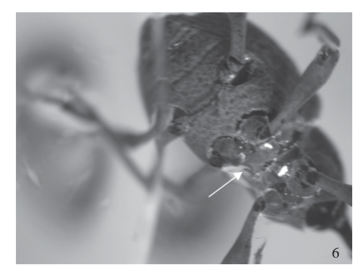
Fig. 6. Arrows indicate the air bubble attached to the ventral surface of the insect body.

into the resting stage position. Meanwhile, the meso- and metathoracic legs are extended. The total time spent in all the stages, that is, in each cycle, is of about 0.32 seconds, of which 0.13 seconds is the stroke, 0.13s is for the recovery and 0.06s is spent in the resting stage. L. fasciatus swims at an average speed of 1.38 cm/s, whereas the female presents higher values if compared to the males (Table I). The maximum and minimum swimming duration time was 11.15 and 5.05 minutes, respectively.