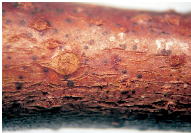
Fig. 1. Necrotic punctures on the epidermis of branches of Annona squamosa caused by Teleonemia morio .

One of the most important of the wide range of pests known to attack Annona spp. is the fruit borer Cerconota anonella Sepp., 1830 (Lepidoptera, Oecophoridae) (Gallo et al. 2002). This moth causes significant direct and indirect damage to the fruit and pulp reducing the commercial value for consumption in natura and for industrial processing (Broglio-Micheletti et al. 2001; Gallo et al. 2002). In the 2010 growing season, however, a population outbreak of a hemipterous insect severely damaged custard apple trees, A. squamosa , in all producing areas in Alagoas, and the widespread attack caused the death of up to 80% of infested plants. The symptoms appeared as a gradual desiccation of branches and eventually of the entire plant. It was possible to observe the presence of nymphs and adults crawling on aerial parts of the plants and forming large groups on the abaxial leaf blade of new and old green branches. Under the stereomicroscope (at 20 x magnification), small necrotic points were detected in the external epidermis of leaves as well as in the phloem region, observed after dissection (Fig. 1).