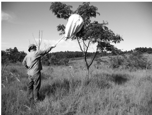
Fig. 1. Psyllids sampling with a beating net in the middle in a seven-year-old plantation of Enterolobium contortisiliquum in an abandoned open-pit coal mine in Candiota, RS, between May 2014 and April 2016.

and is utilised for a variety of purposes. It is planted as shade tree in streets and gardens as well as in agroforestry systems, e.g., for cocoa and yerba mate. Its rapid growth and nitrogen-fixing abilities make it useful for revegetation, soil stabilisation and improvement, as well as land reclamation. It is tolerant of copper-contaminated soil. The tree is also harvested for its timber and medicinal uses, and the foliage is eaten by cattle (Praciak et al., 2013).