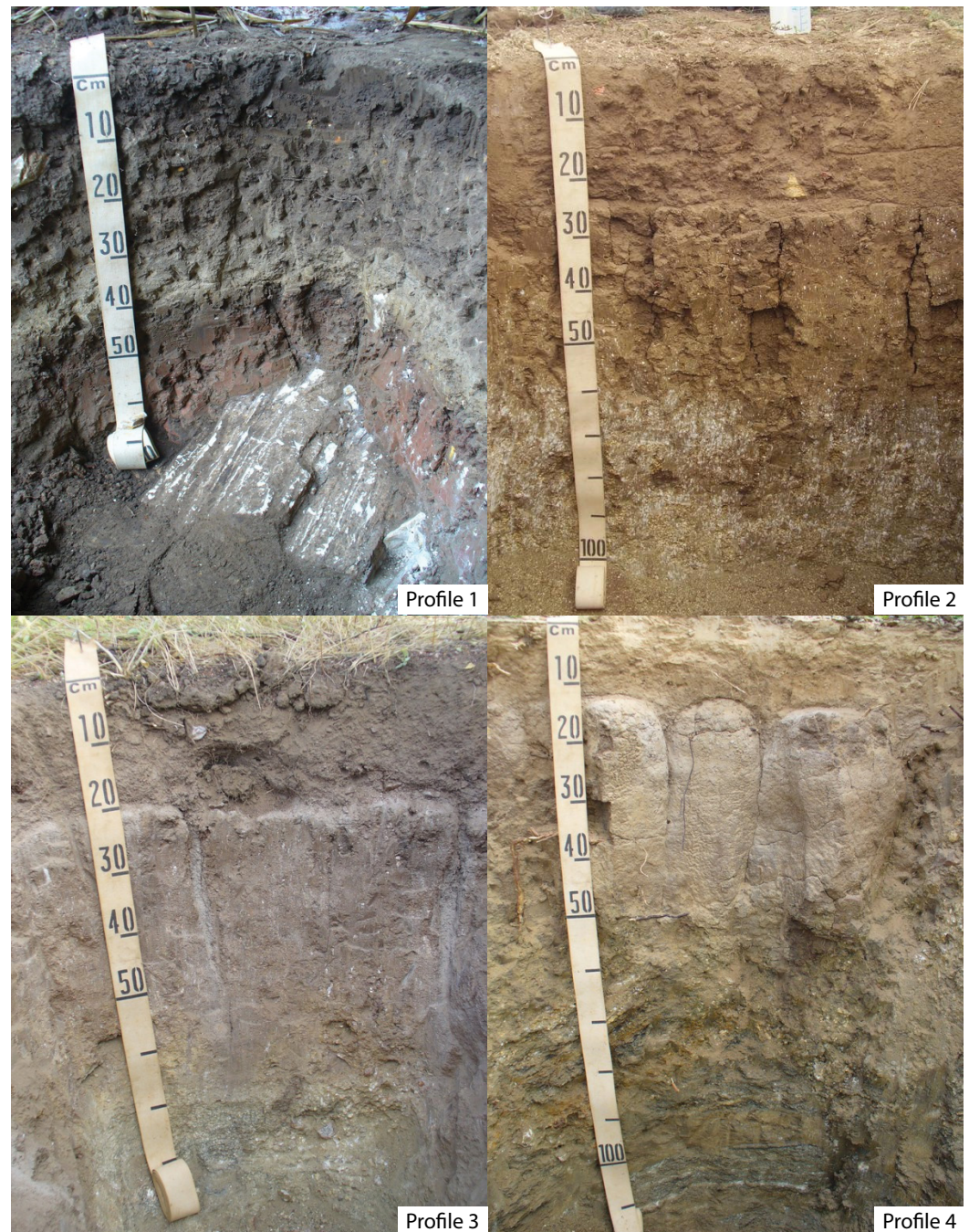
Figure 2. Soil profiles studied (a) profile 1 - Planossolo Háplico Eutrófico solódico (Typic Albaqualf); (b) profile 2 - Planossolo Háplico Eutrófico solódico (Typic Albaqualf); (c) profile 3 - Planossolo Nátrico Órtico típico (Typic Natraqualf); (d) profile 4 - Planossolo Nátrico Órtico salino (Typic Natraqualf).

The textural contrast observed in the field during soil morphological descriptions (Table 1) was confirmed by the granulometric analysis and the textural differentiation index (TDIh) (Table 2), evidencing the abrupt textural change between A or E horizons and the Btn.