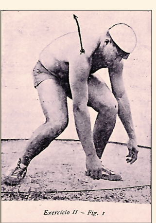
FIGURE 9 EXERCISE 1 OF FLEXING LEGS AND EXTENDING TRUNK