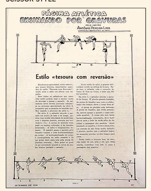
FIGURA 13 TEACHING THROUGH SKETCHES: REVERSE SCISSOR STYLE