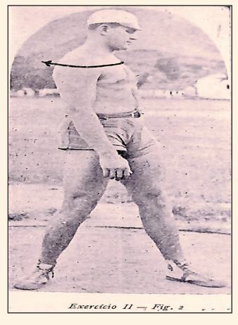
FIGURE 10 EXERCISE 2 OF FLEXING LEGS AND EXTENDING TRUNK