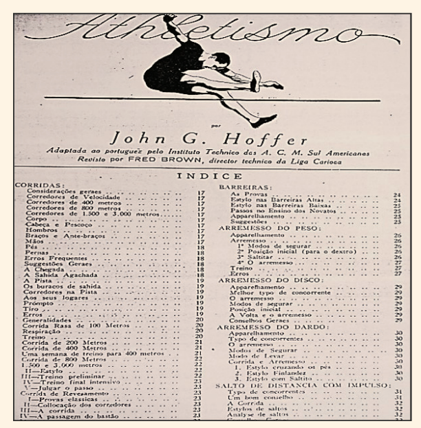
FIGURE 6 TABLE OF CONTENTS OF THE TRACK & FIELD COLLECTANEA

As seen in Figure 6, found on page 15 of the journal, the editors used a reading device that showed the contents of the collectanea – a tool not used in any of the other collectanea mapped. In this internal table of contents, the main themes refer to track competitions and the subtopics included the topics to be addressed, all with indications of page numbers. This is the case of the hurdles races, which discussed high and low hurdles; steps for teaching new athletes; equipment and suggestions.