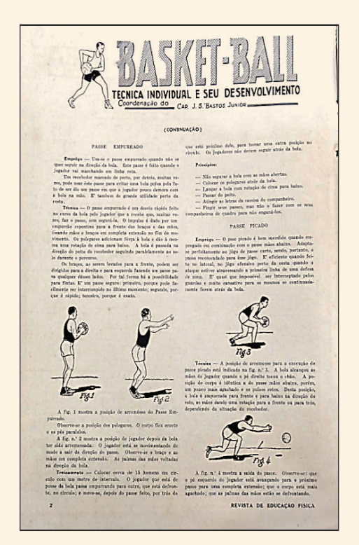
FIGURE 2 TEACHING THE PASS

The nature of the articles published in the collectanea was the same as that presented in later issues. In addition, the fact that the collectanea was published in REPHy did not mean that the teaching of the technical and tactical foundations of the modality would be present only in this journal. To the contrary, we also mapped progressions in REF, as seen in figures 2 and 3.