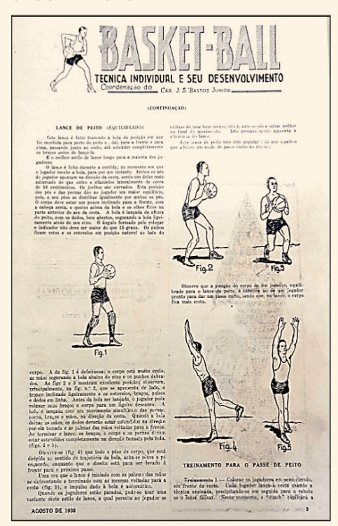
FIGURE 3 TEACHING THE PUSH, HOOK AND SHOULDER SHOT