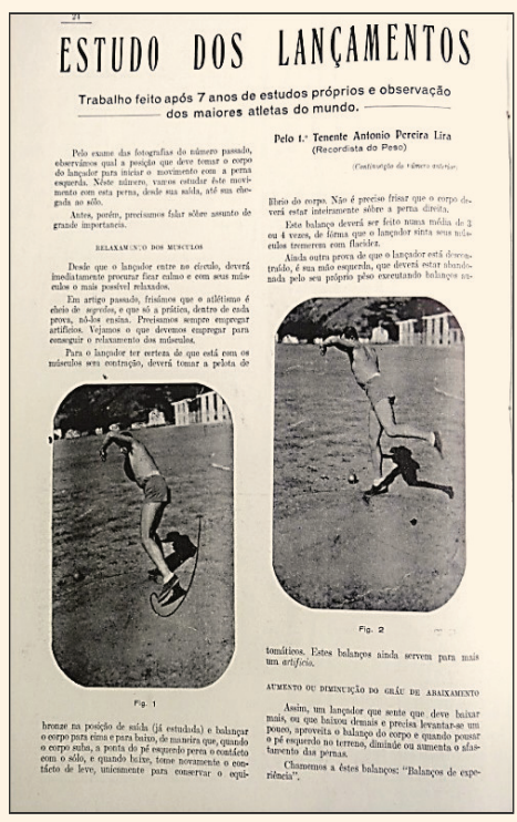
FIGURE 7 STUDY OF THROWS