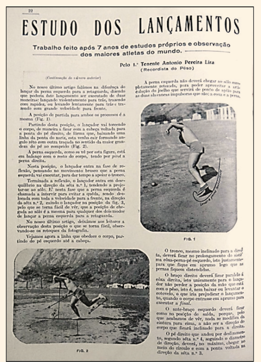
FIGURE 8 STUDY OF THROWS (CONTINUED)