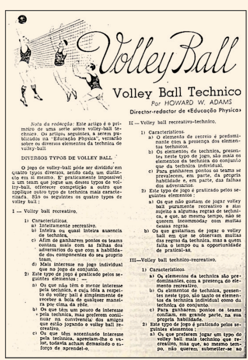
FIGURE 15 PRINCIPLES OF VOLLEYBALL