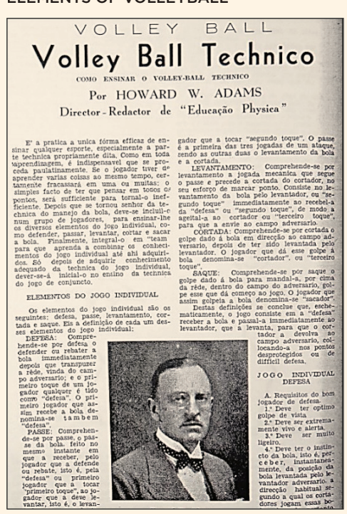
FIGURE 16 ELEMENTS OF VOLLEYBALL