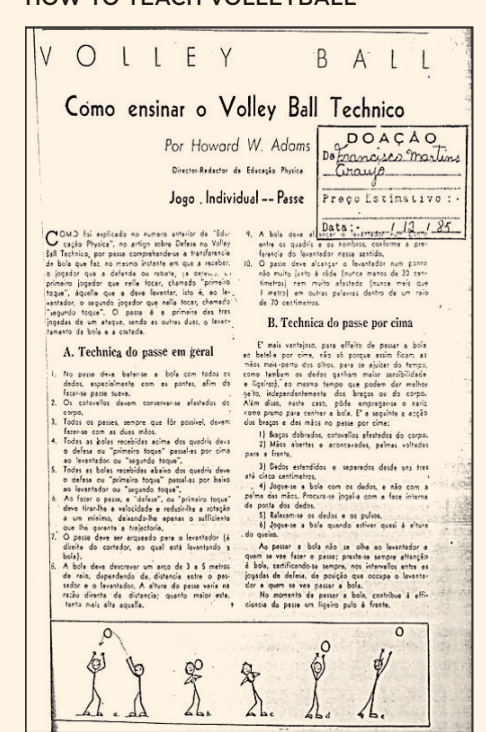
FIGURE 17 HOW TO TEACH VOLLEYBALL