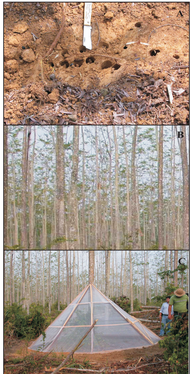
Figure 2. Exit holes of Quesada gigas (A), plants of Schizolobium amazonicum with symptoms of attack by this insect (B) and trap to capture nymphs (C).