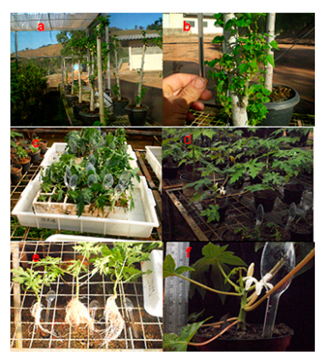
Figure 1 – Mini-cutting stages of papaya in a semi-hydroponic system. a – Mother papaya plants with buds. b - Papaya buds. c - Rooting of papaya mini-cuttings in a semi-hydroponic system. - Clones of 'UENF / CALIMAN 02' papaya rooted in a semi-hydroponic system and transplanted to pots. e - Papaya clones exhibiting the root system. f - Papaya plant obtained by mini-cutting technique with 15 cm already presenting hermaphrodite flowers.

a completely randomized design with three replicates and six mini-cuttings per replicate. The final evaluation was performed at 90 days, when plants were removed from pots and had their roots carefully washed. The length of shoots, the length of the largest root, the dry mass of shoots and the root system, the rooting percentage and of live cuttings were evaluated from the initial number. Data were submitted to analysis of variance and the means were compared by the Tukey test at 5% probability, and for the dry mass of shoots and the root system, data were also submitted to regression analysis. The 'GENES' statistical software (CRUZ, 2016) was used.