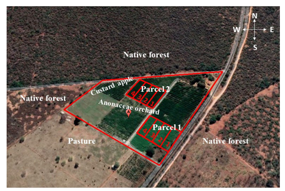
Figure 1 - Sketch of the commercial Annonaceae orchard and the representation of the experimental area with the plot location within parcel 1 and parcel 2. Janaúba, MG.

The study was conducted in a commercial orchard located in the municipality of Janaúba, North region of Minas Gerais (15.00° 52.00' 5.02" - S and 43.00° 19.00' 46.51" - O), with cultivation of 6 ha of atemoya 'Gefner' and 0.4 ha of custard apple. The orchard is mainly surrounded by a large extension of native forest in the North, East and West directions, and by a pasture area in the South direction (Figure 1).