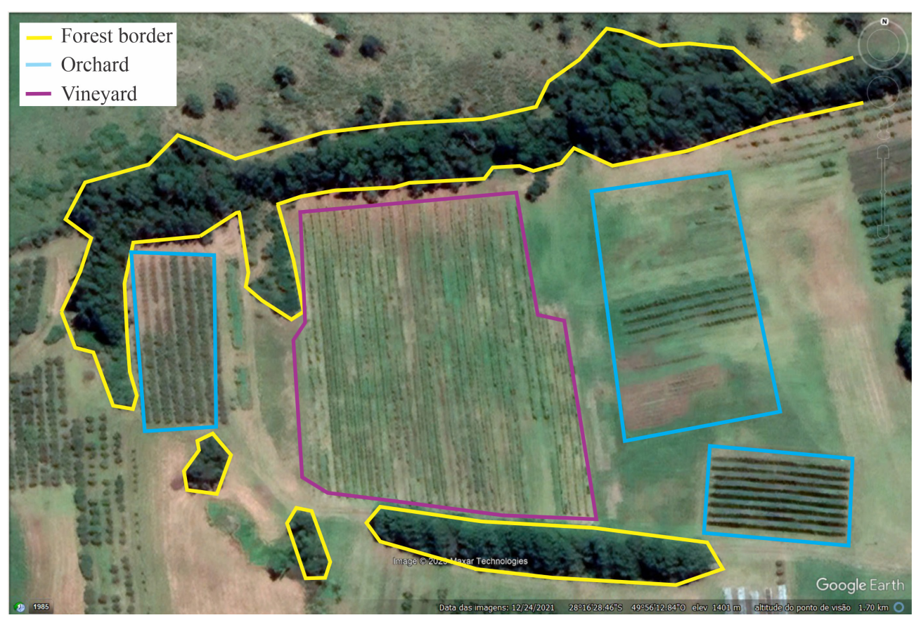
Figure 1. Satellite image locating the experimental vineyard at the São Joaquim Experimental Station of the Santa Catarina Agricultural Research and Rural Extension Company, and the surrounding plant composition.