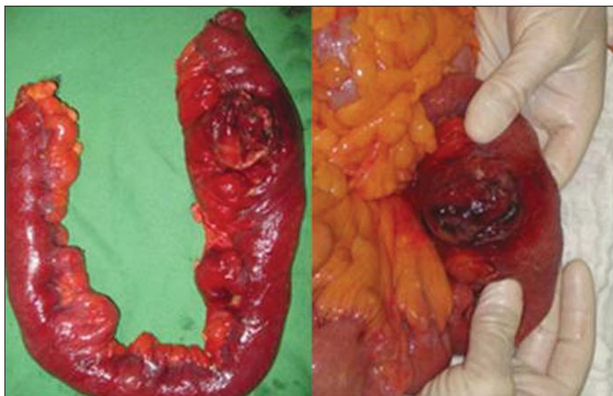
Figure 2. Images of surgical specimen: jejunal diverticulum complicated with diverticulitis, demonstrating inflammatory process and obstructed perforation.

Tomographic findings of jejunal diverticulitis are similar to the ones of colonic diverticulitis: inflammatory mass containing gas and/or fecal residues, wall thickening in the affected segment (increased contrast uptake), with distension and edema of adjacent tissues (densification of the fascia and mesenteric fat) (4,6,7) . In the present case, the imaging findings are compatible with the ones described in the literature and