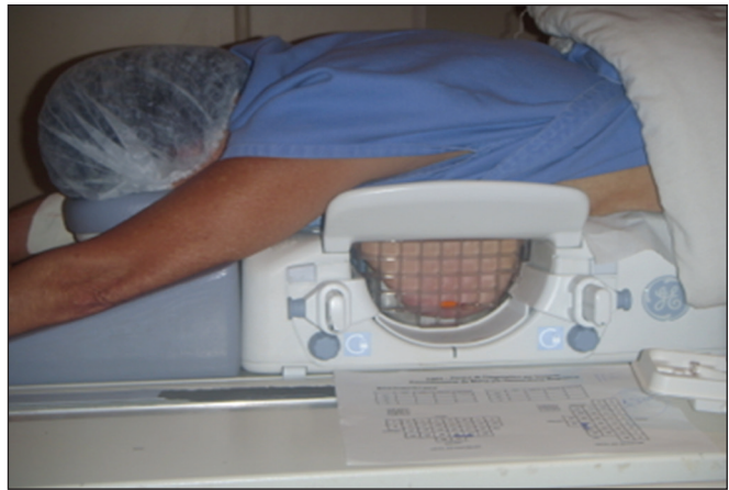
Figure 1. Patient positioned for the procedure, with the vitamin capsule, biopsy grid, and schematic diagram used in order to guide the biopsy.

The MRI-guided vacuum-assisted biopsies were performed by two radiologists specializing in diagnostic and interventional breast imaging. A 1.5 T MRI scanner (Signa Excite HD; GE Healthcare, Milwaukee, WI, USA) was used for the procedures. Patients were placed in the prone position, and the images were acquired with a dedicated