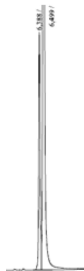
Figure 1. Analysis by chiral GC (β-cyclodextrin) of α-pinene isolated from ripe fruits of S. terebinthifolius

Part of crude oil obtained from Method 1 (6.0 g) was subjected to flash chromatography on Si-gel column (60 X 5 cm) eluted with pentane (400 mL), CH 2 Cl 2 (400 mL) as well as with a gradient of CH 2 Cl 2 -MeOH 95:5 (300 mL) and 9:1 (200 mL) to afford fifty fractions (20 mL each) which were individually analyzed using gas chromatography. GC chromatograms of fractions 1-16 showed to be composed by complex mixtures of hydrocarbon derivatives. Thus, these fractions were pooled (2.6 g) and purified by SiO 2 gel coated with AgNO 3 (10%) column chromatography (40 X 3 cm) eluted with pentane:CH 2 Cl 2 1:1 (400 mL) to afford 1533 mg of pure α-pinene (97% by GC), whose structure was identified by NMR and MS spectral analysis and comparison with literature data. 21 Optical rotation measurement [α] D 20 - 46.3 (MeOH, c 2.9), followed by chiral GC analysis, indicated that the major enantiomer (80%) is the (-)-isomer (Figure 1). 22