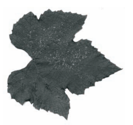
FIG. 1 – Leaf of Vitis labrusca 'Niagara Rosada' doubly infected by HSVd and CEVd showing yellow speckle symptoms.

all structural domains in the molecule (Figure 2), which could influence symptom expression (Sano et al. , 1992).