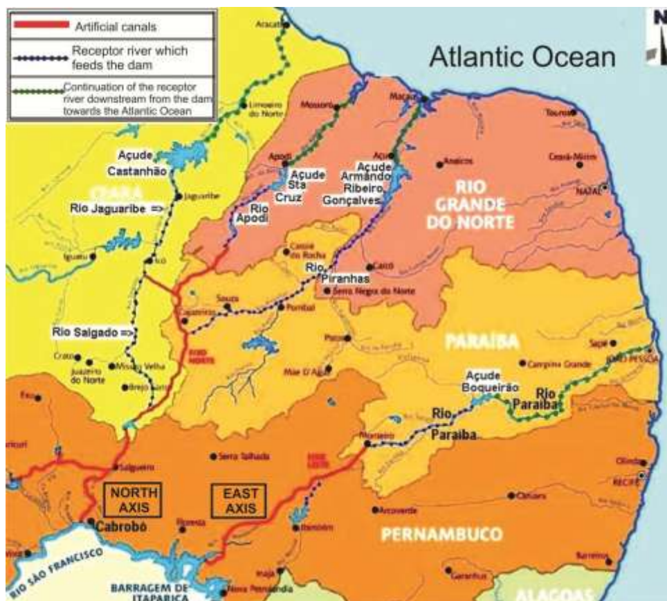
FIGURE 2. Transposition: route of water distribution at semiarid region.