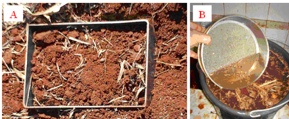
FIGURE 3. Quantification of straw mass in the sowing line interior. (A, metal box with soil in the line and B, immersion of the sample to collect straw from soil with the aid of a sieve).

Straw mass in the line interior was also evaluated, by manually removing the straw on sowing line surface and collecting soil with mobilized straw in the line interior (Figure 3-A) in seven samples per parcel, using metallic boxes with dimensions of 0.15 x 0.10 x 0.10 m (length, height and width). After soil collection, the samples were packed in plastic bags with identification. Subsequently, the samples were immersed in a water container, with the suspended straw being collected in a 3 mm mesh sieve (Figure 3-B) and the rest obtained through sample washing. The straw was packed in paper bags and kiln dried at 60°C, until the constant weight was obtained. The results allowed an extrapolation of the achieved values for grams per cubic meter of mobilized soil according to the proposition of BRANDELERO et al. (2012).