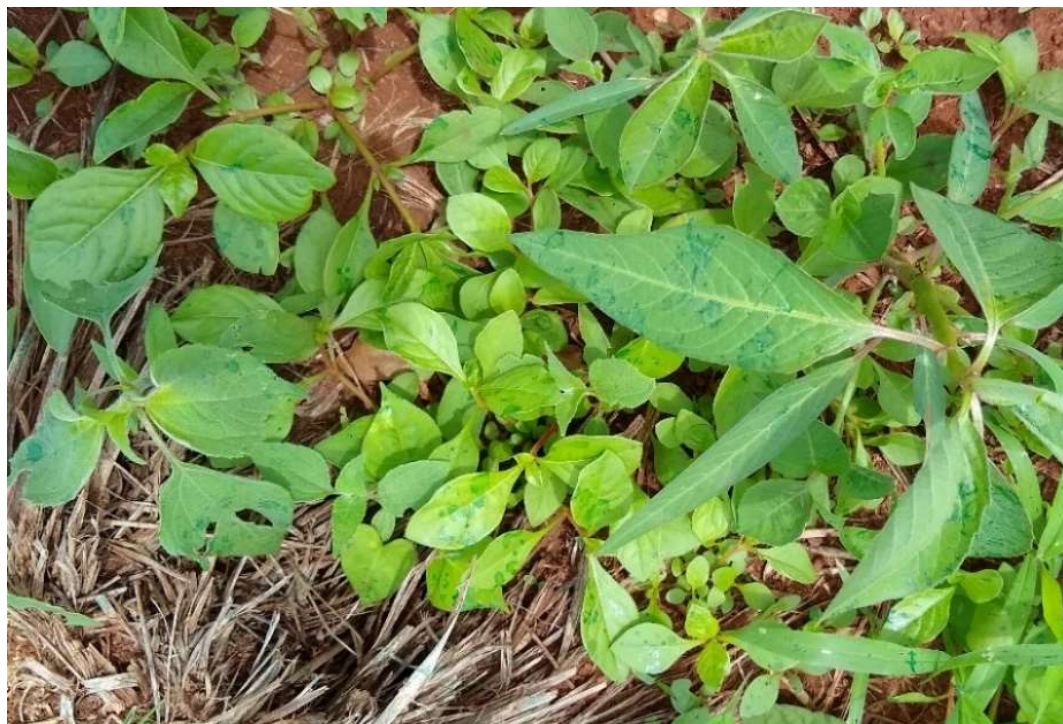
FIGURE 1. Example of the coverage obtained (blue spots) in one of the experimental plots with the application of ultra-coarse droplets at a volume of 58 L ha -1 .

Figure 1 shows how the low spray volume (58 L ha -1 ), associated with the ultra-coarse droplets, results in reduced coverage (blue spots), which can be problematic for managing difficult-to-control weeds. In this scenario, increasing the spray volume may minimize the problem.