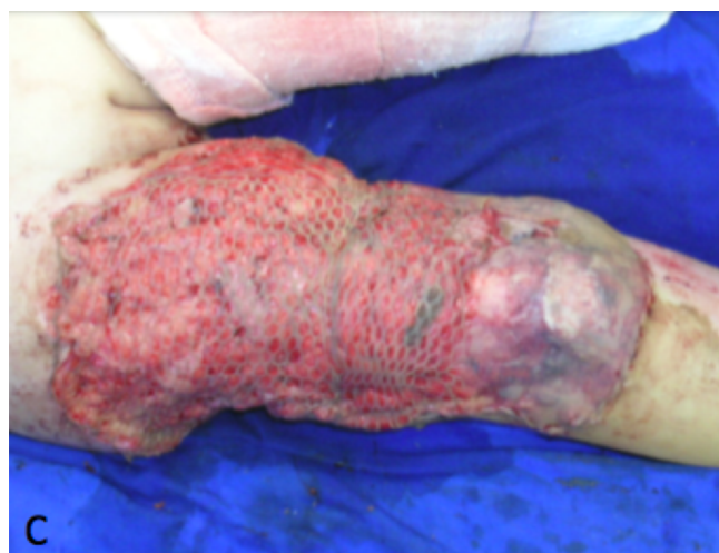
Figure 2 - Immediate mesh skin grafting in the first operation (donor area: degloved flap).