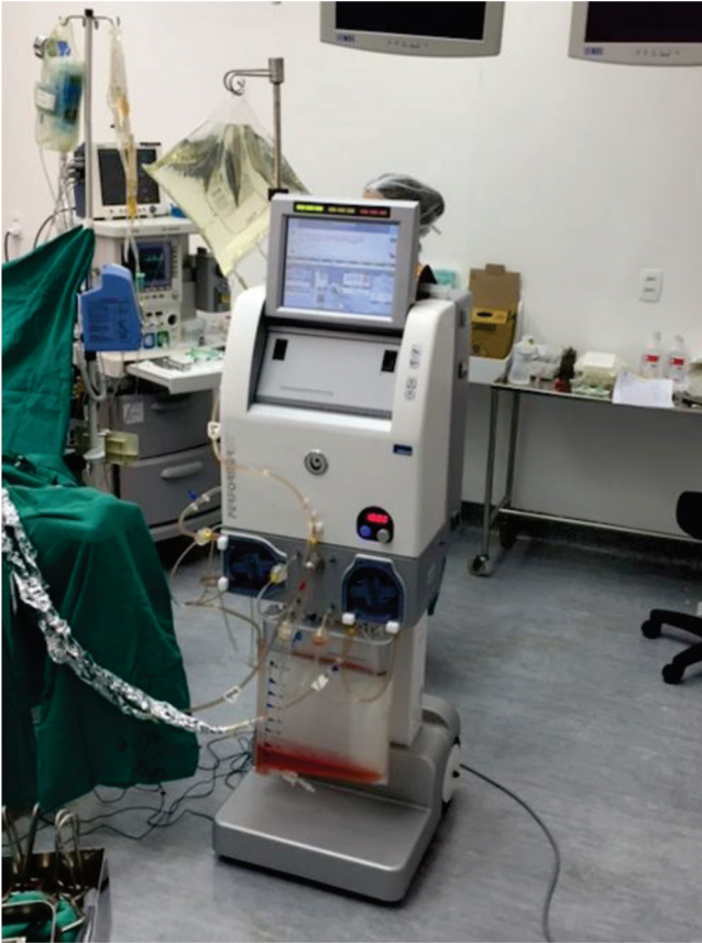
Figure 1. Performer HT device in use during HIPEC procedure.

more heat at lower flow rates. Herein, we found that the difference between inlet and outlet temperature probes were about 3°C at a flow rate of 600ml/min, and 1°C at 1000ml/min. Interestingly, the temperature lost to peritoneal cavity remained virtually stable at about 2°C at a flow rate of 700, 800 and 900 ml/min.