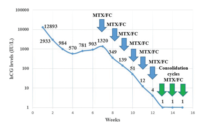
Fig. 5 Chart showing postmolar monitoring with hormonal surveillance and with periodic doses of hCG as well as chemotherapeutic treatment of the postmolar gestational trophoblastic neoplasia.

The difficulty in correctly diagnosing EMP occurs because morphological abnormalities found during tubal pregnancy appear earlier than those seen in the trophoblastic tissue of miscarriages, at least in later cases. In ectopic pregnancy cases, it is possible to observe exuberant extravillous trophoblastic proliferation that is associated with apparent local invasion of surrounding tissues by trophoblasts, caus-