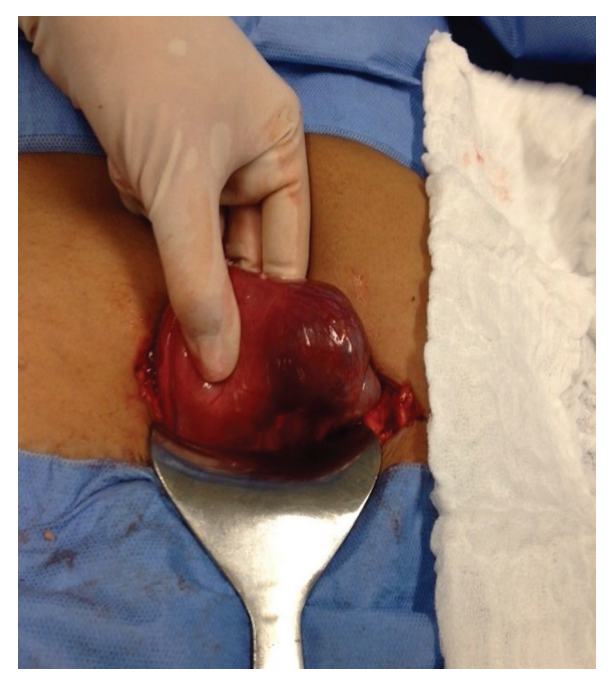
Fig. 2 Exploratory laparotomy via a Pfannenstiel incision with evidence in the abdominal cavity of a softened uterus with a burgundy-colored tubal mass on the left measuring \sim 7.0 cm and accompanied by hemoperitoneum, which are suggestive of ectopic pregnancy.

Chemotherapy with 1 mg/kg intramuscular methotrexate (MTX) was initiated on days 1, 3, 5, and 7, with 15 mg folinic acid rescue therapy (citrovorum factor [CF]) orally administered on days 2, 4, 6, and 8 (MTX/CF). The treatment was well tolerated, and the patient's only complaint was dry eyes (treated with artificial tears) and oral mucositis in the last chemotherapy cycle (treated with a mouthwash solution containing 150 mL of benzydamine hydrochloride + 25 mL of nystatin solution, vitamin E 5 capsules, and 20 mL of 2% lidocaine without a vasoconstrictor; 10 mL of this mixture were diluted in 10 mL of cold 0.9% saline and used as a