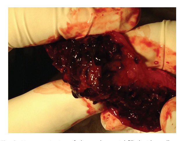
Fig. 3 Macroscopic view of placental material filled with small hydropic vesicles, suggestive of a hydatidiform mole in the Fallopian tube.

The first report on EMP was written by Otto in 1871.<sup>18</sup> Less than 300 cases of EMP have been reported over the past 150 years, showing the rarity of the association of this double obstetric complication.<sup>9–11</sup> In addition, many of these cases initially reported as EMP were reassessed and later