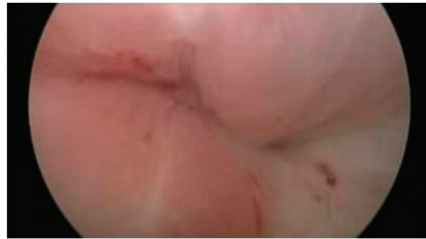
Fig. 2 Fistulous orifice viewed through cystoscopy.

planned. The fistulous tract was excised, and the bladder was sutured in two layers. ►Fig. 2 depicts the surgical specimens with the uterus and the bladder wall showing the fistulous orifices (►Fig. 2). There were no adverse events. The patient was discharged in the third postoperative day. She remained with a bladder catheter for 14 days. After the removal of the catheter, she had no more symptoms. By the time of this publication, the patient will have been asymptomatic for two years after surgery.