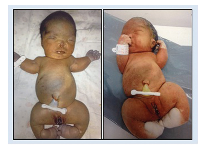
Fig. 2 Stillborn with short stature, short and curved femurs, club feet, macrocephaly, broad forehead, hypertelorism, nasal hypoplasia, micrognathia, short neck, humerus agenesis, thoracic narrowing, short and spatulate fingers.

Samples: The DNA sample was extracted from the saliva of the father, which was collected with the Oragene DNA Collection Kits OG-500 and OG-575, and purified following prepIT-L2P manufacturer's instructions (DNA Genotek, Ot-tawa, ON, Canada). For the controls, we used our in-house whole exome sequencing data from 609 Brazilians (Online Archive of Brazilian Mutations, ABraOM: http://abraom.ib.