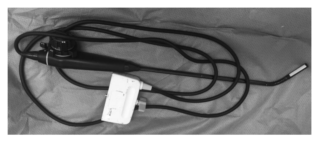
Fig. 1 Ultrasound laparoscopic probe.

patients who underwent laparotomy, a linear probe (8.0– 14.0 MHz linear transducer) was used. The ultrasound laparoscopic probe ( Fig. 1 ) was inserted through a 12-mm trocar located in the suprapubic or left inferior lower quadrant. Conventional gray scale sonography was performed by the surgeon, and normal ovarian parenchyma, solid components, and septa were evaluated.