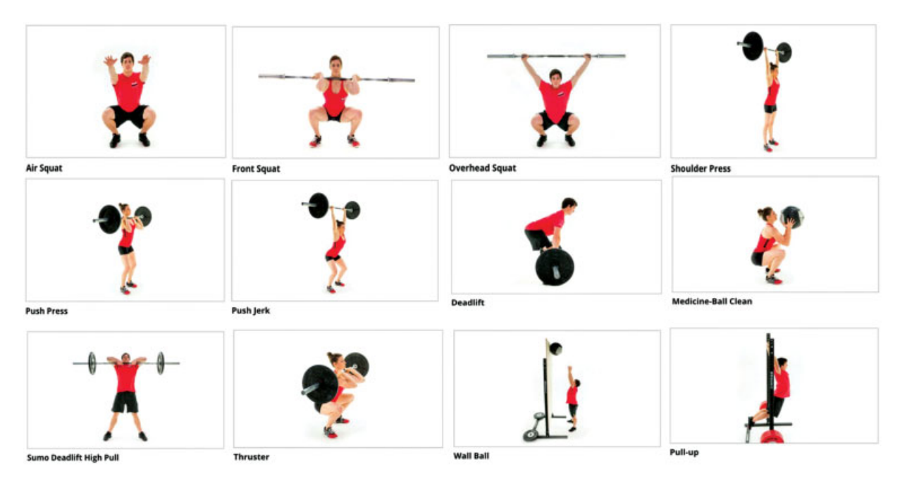
Fig. 1 Basic elements of crossfit.

before and during the quarantine by COVID-19 in CrossFit women and their relationship with training level.