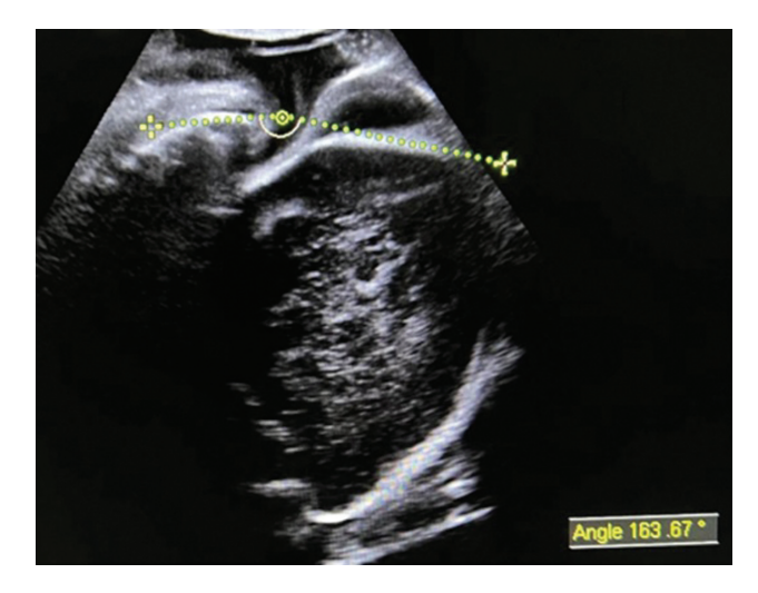
Fig. 2 Ultrasound imaging demonstrating the angle of progression (AoP) access.

A systematic review has shown that ultrasound is superior to digital VE for evaluation of fetal head position in the first stage of labor, in addition to the great agreement