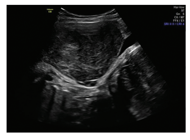
Fig. 4 Extensive leiomyoma in the anterior uterine wall.