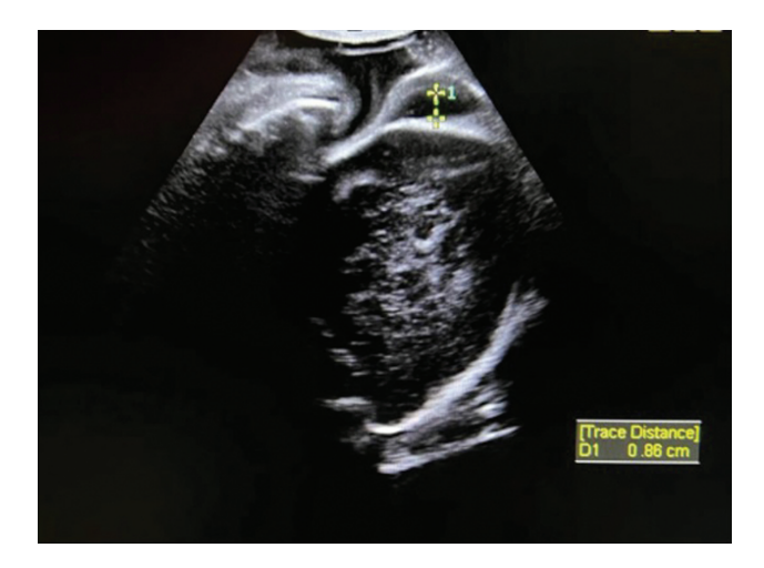
Fig. 3 Ultrasound image in the delivery room showing the measurement of caput succedaneum.

A different use of ultrasound during the labor is by creating a sonopartogram, which is a conformation of the conventional partogram, with the use of ultrasound parameters of recording assessments during the labor.<sup>69,70</sup> It is possible to evaluate cervical dilatation, fetal head rotation, and fetal head descent, as it is in the conventional partogram, as well as to evaluate caput and molding<sup>69,70</sup> ( Figure 3 ). Although a good agreement was shown between VE and ultrasound evaluation regarding cervical dilatation and head rotation during the first period of labor, the evaluation of head descent was better estimated by VE.<sup>60</sup> Another possibility for the use of ultrasound in the delivery room would be the prediction of success for vaginal delivery on patients with leiomyomas located in regions close to cervix; however, we did not find any data about this topic ( Figure 4 ).