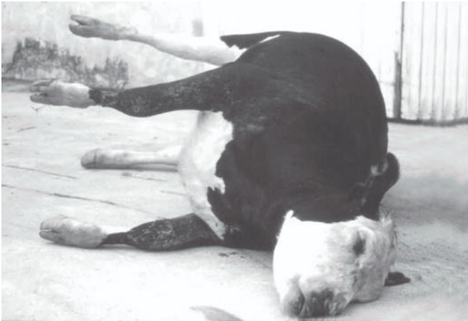
Fig.2. Animal dead of anthrax in Outbreak 4. This animal died at 9:00-10:00 pm and was photographed at 8:00 am the next day. The carcass is very much enlarged due to bloat and gaseous distention, and dark tarry blood is exuding from the nose.