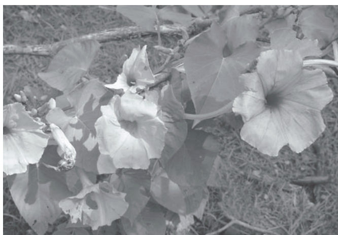
Fig.2. Ipomoea riedelii , municipality of Zabelé, Paraíba, Brazil.

(Seitz et al. 2005) and cattle (Barros et al. 2006). I. carnea subsp. fistulosa is toxic for goats (Tokarnia et al. 1960, Armien et al. 2007, Riet-Correa et al. 2003), cattle and sheep (Tokarnia et al. 1960) and Turbina cordata in goats, cattle (Dantas et al. 2007) and horses (F. Riet-Correa & A.F.M. Dantas, unpublished data). The objective of the research reported here was to study the toxicity of swainsonine contained in I. sericophylla and I. riedelii in goats as a descriptive comparison of the toxicity of these two species of Ipomoea with other swainsonine containing plants, and to evaluate the reversibility of the clinical signs in affected goats.