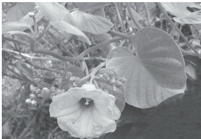
Fig.1. Ipomoea sericophylla , municipality of São Sebastião de Umbuzeiro, Paraíba, Brazil.

Ipomoea sericophylla (Fig.1) and Ipomoea riedelii (Fig.2) contain swainsonine and cause glycoprotein storage disease in goats in the semiarid regions of Paraíba. (Barbosa et al. 2006). Other swainsonine containing plants in Brazil are Sida carpinifolia (Colodel et al. 2002b), Ipomoea carnea subsp. fistulosa (Haraguchi et al. 2003) and Turbina cordata (Dantas et al. 2007). S. carpinifolia causes intoxication in goats (Driemeier et al. 2000, Colodel et al. 2002a) horses (Loretti et al. 2003), sheep