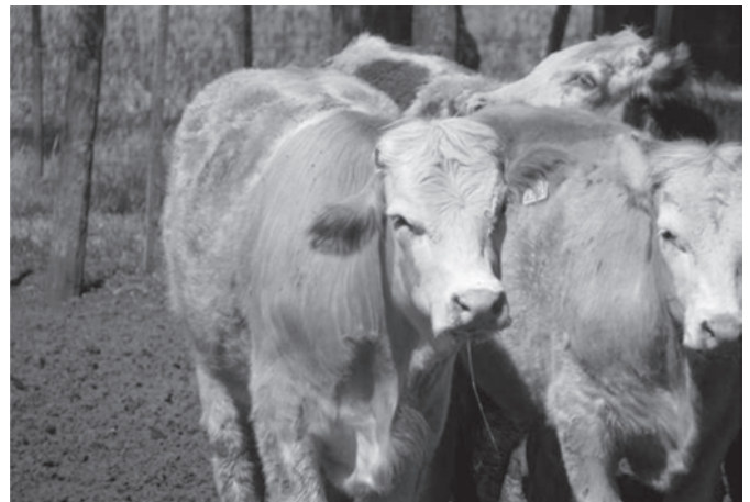
Fig.1. Facial paralysis signs registered in an affected steer (outbreak F).

Including the 6 outbreaks in cattle, 458 out of 5140 animals were affected. Morbidity was variable among the outbreaks, ranging from 1.12% to 50% and mortality rates were very low, ranging from 0 to 1%. Only three animals from outbreak A and 5 from outbreak E spontaneously died several days after the onset of the clinical signs. The majority of the affected cattle had a slow, but complete recovery, whereas others still showing some neurological sequelae, such as ear drooping and slight head tilt after two months. All animals showed typical signs of facial paralysis and vestibular disease, characterized by head tilt, uni or bilateral drooping and paralysis of the ears, eyelid ptosis (Fig.1), different degree of ataxia, kerato-conjunctivitis, and excessive lacrimation. Otitis externa was not observed in any of the 6 outbreaks. Only animals from outbreak E had a history of evident signs of respiratory disease 1 to 2