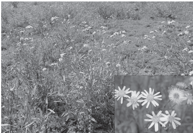
Fig.1. (A) Pre-calving area infested by fireweed ( Senecio madagascariensis ). Note also the invasion by the low, mat-forming Bindi weed ( Soliva sp.). (B) Insert shows the yellow, daisy-like flowers (usually with 13 petals) and the white, slender, and light seeds of S. madagascariensis .