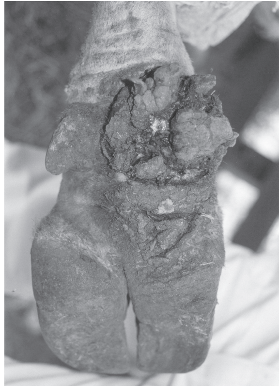
Fig.1. Severe papillomatous proliferative digital dermatitis in the accessory digit of a dairy cow.

Fifteen Holsteins, male and female, with different ages and affected with DD on the accessories digits were used in