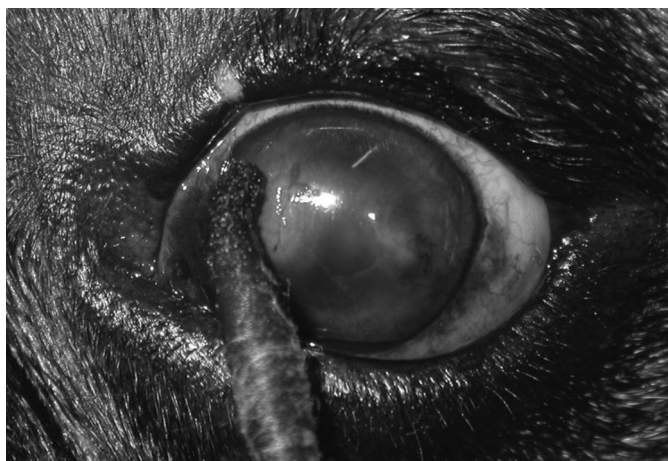
Fig.3. Corneal debridement/cauterization, performed at the left eye of a 8-year-old Boxer dog after topical anesthesia, utilizing a tweezer of smoothed edges and cotton tip, impregnated with povidone iodine, diluted at 0.2% in distilled water.