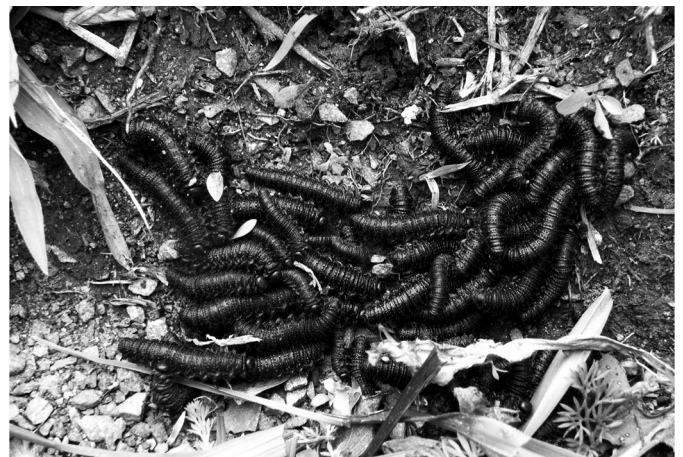
Fig.1. A group of black Perreyia flavipes larvae crawling over the grass.

and abdominal cavities; the liver was somewhat enlarged (round edges) and mottled with had a accentuation of the lobular pattern; this was best seen at the cut surface as 1-2mm in diameter bright red depressed irregular areas surrounded by lighter (beige or tan) areas (Fig.2). The red areas would later be identified on histological examination as consisting of centrilobular necrosis. There was edema of the gall bladder wall. Subendocardial and suppicardial petechiae and ecchymosis were also observed. Sawfly ( P. flavipes ) larval body fragments and heads were found in the rumen. The main microscopic lesion was restricted to the liver and consisted of centrilobular to massive hepatocellular necrosis. In most lobules necrotic areas extended up to the portal triads where only a few viable hepatocytes