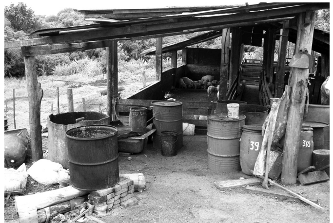
Fig.2. Botulism in swine associated with the type C toxin. Storage of food waste in metal or plastic barrels without shelter from the sun and under poor sanitary and hygiene conditions at pig rearing and slaughter farm.

ted pigs was flaccid paralysis (Fig.3). Anorexia, weakness, lack of coordination, locomotion difficulties with the evolution of lateral decubitus, and involuntary urination and defecation was also observed. It was noted that every time the pigs were stimulated to get up, they made an intense noise. A reduction in the consumption of water and food was observed and finally death. In the necropsy no significant alterations were found. Occasionally there was discrete ascites, the liver had multifocal white spots (parasite migration), and the inguinal lymph nodes were slightly enlarged. There were no significant alterations observed during histologi-