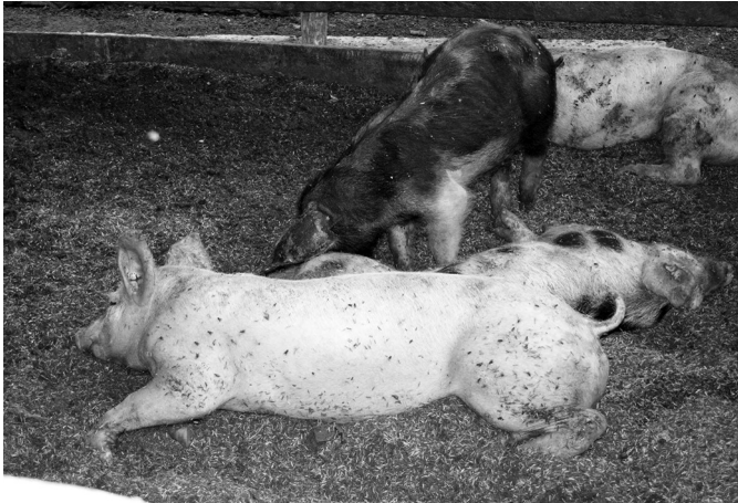
Fig.3. Botulism in swine associated with the type C toxin. Pigs with clinical signs of flaccid paralysis.

cal examination. The intraperitoneal inoculation of the intestinal contents and samples of food into mice produced clinical signs characteristic of botulism. This material was then characterized with use of homologous antitoxins in mice of CDC (Center for Disease Control and Prevention), indicating that botulinum toxin type C was responsible for four of the five outbreaks monitored.