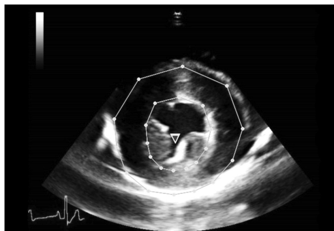
Fig.1. A two-dimensional image from the right parasternal short axis view of a maned wolf. Notice the marked endocardial and epicardial border created by the speckle tracking software.

All data (conventional echocardiography and speckle tracking) were expressed as mean \pm standard deviation (SD). For