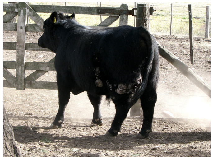
Fig.1. Multiple coalescing, ulcerative and fistulated dermatitis in the left hind limb of Bull B.

Actinobacillus lignieresii was isolated from the exudate collected from Bull B. This isolate was resistant to amikacin, amoxicillin-clavulamic acid, cefotaxime, cephalixin, erythromycin, neomycin, cloxacillin, rifampicin, vancomycin, ampicillin, enrofloxacin and penicillin, and was sensitive to tilmicosin, tetracycline, oxitetracycline, streptomycin, cefaclor, cefalotin, cloranfenicol, florfenicol, gentamicin, kanamycin, norfloxacin, ofloxacin, sulfonamides, trimeto-