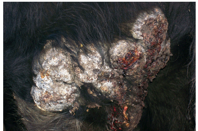
Fig.2. Higher magnification of the lesion in the left hind limb of Bull B.