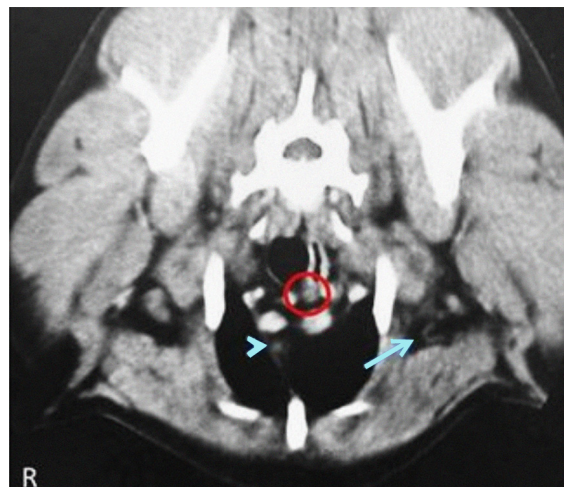
Fig.2. CT transverse image of the cranial mediastinum in a dog number 9 (Biba). The left axillary lymph node is observed hypodense (arrow). Isodense mediastinal lymph node measuring 8mm (circle) and another hypodense measuring 3mm (arrow head) were also observed.

The Table 2 presents the results of measurements and attenuation of lymph nodes. Axillary lymph nodes were visible, from two sides (Fig.1) or one side (Fig.2), and one or more by side, on the computed tomographic images of nine (60%) animals. Normal distribution was also noticed for the smallest diameter of the axillary lymph nodes, with average of 3.58 millimeters (mm) ( SD \pm 2.02 ) and with minimum and maximum values of 1 and 7mm, respectively.