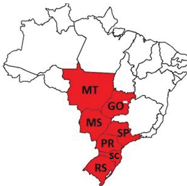
Fig.1. Areas in red represent the states in which are located the intensive pig farms sampled for analysis.

Among the 1,940 pig blood samples collected, 1,594 were taken from bleeding procedure at slaughterhouses in the region of Jaboticabal, São Paulo, coming from seven different states (RS, SC, PR, SP, MT, MS, GO), in a total of 30 intensive pig farming, as seen in Figure 1 and Table 1. The other 346 blood samples were from 56