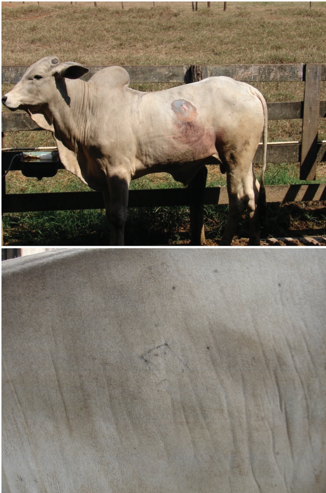
Fig.2. Steer 15 minutes and 21 days after rib biopsy.