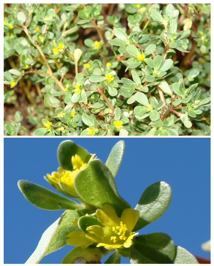
Fig.1. Portulaca oleracea in the municipality of Patos, Paraíba state, Brazil.

the plant. The clinical signs described by the farmer were weakness, bloat, restlessness, increased urinary frequency, and recumbence, followed by death. Plant samples tested positive for nitrates/nitrites using the diphenylamine test.