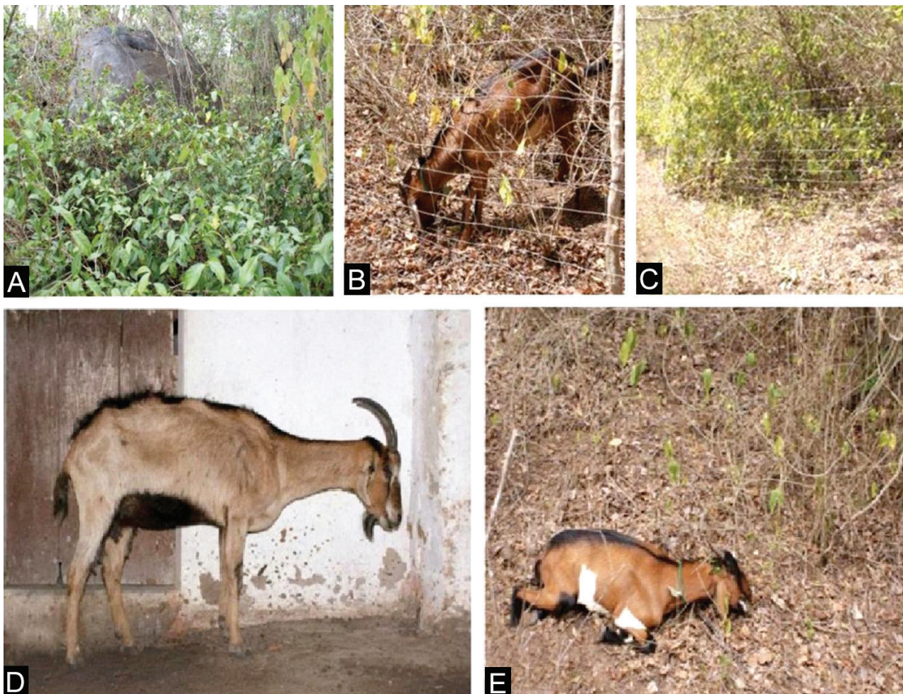
Fig.1. (A) Area with large amount of Amorimia septentrionalis in the location where the experiment was carried out (Limoeiro/PE). (B) Caprine spontaneously ingesting the leaves of A. septentrionalis 16 days after the start of the experiment. (C) Predominance of A. septentrionalis in comparison with other plants. (D) Caprine from Group 3 presenting extended neck and engorged jugular after natural ingestion of A. septentrionalis . (E) Caprine from Group 2 showing clinical signs of intoxication, which evolved to death 57 days after the natural ingestion of A. septentrionalis .

From the 16th to the 22nd day of the experiment, it was observed that goats from all groups began to ingest more