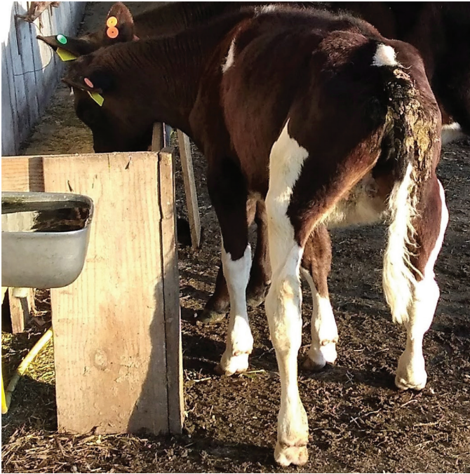
Fig.4. Experimental reproduction (Experiment stage 2). Calf with angular deformity of the pelvic limbs and moderate thickening of the joints.