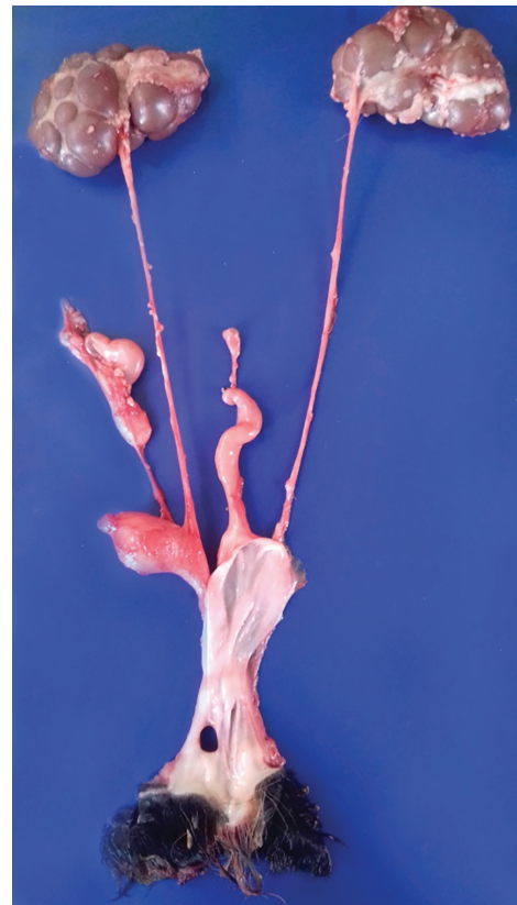
Fig.3. Experimental reproduction (Experiment stage 1). Urogenital tract of a calf showing deviation of the right ureter with blind ending and extending from the kidney to the cervix; the left uterine horn and ovary were inside the bladder neck.