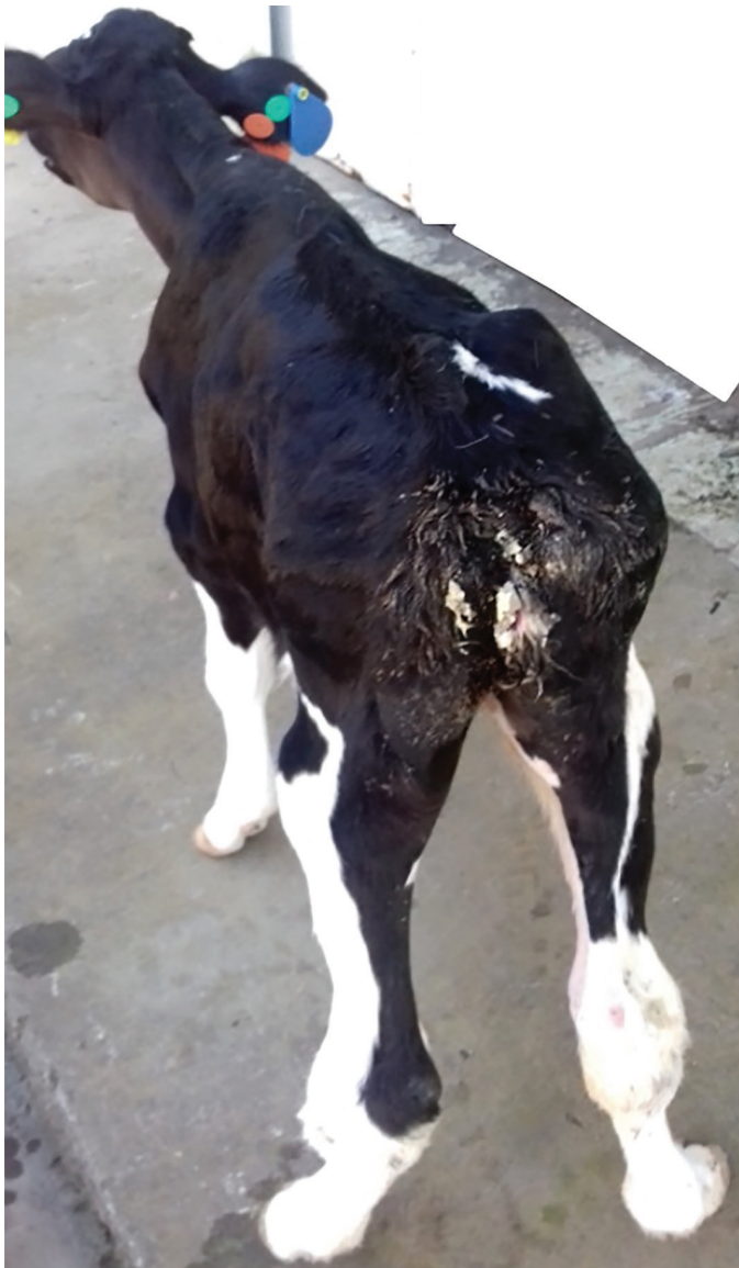
Fig.1. Experimental reproduction (Experiment stage 1). Calf with curved posterior limbs, thickened articulations, and absence of the coccygeal vertebrae.

The urogenital tract showed deviation of the right ureter, which had a blind ending and extended from the kidney to the cervix; the left uterine horn and ovary were inside the bladder neck (Fig.3). In experiment stage 2, eight cows gave birth to normal calves, and one cow in Group I bred a calf with curved posterior limbs, moderate thickening of the articulations, and flattened hooves, which impaired mobility and balance (Fig.4).